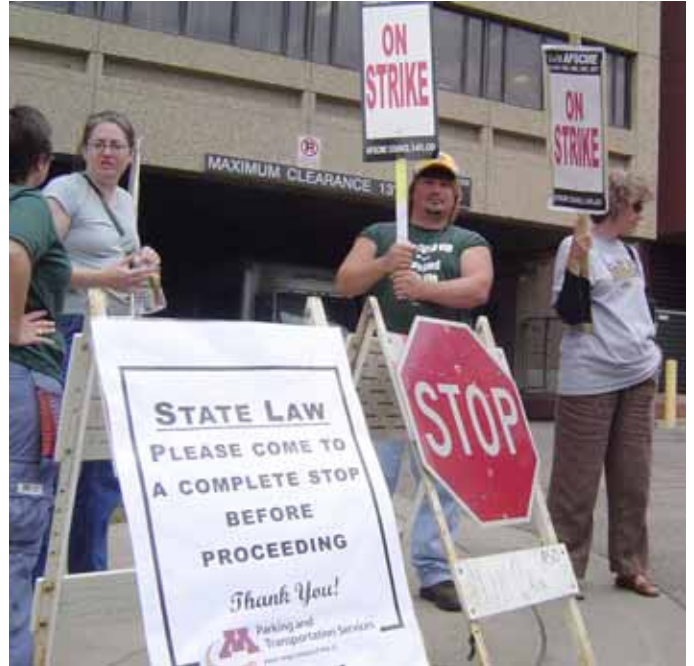
Pickers at KE Dock on East River Road