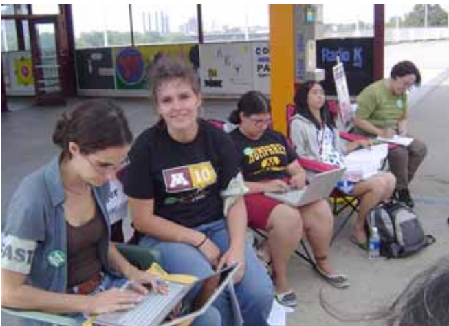
Student hunger strikers on Monday afternoon

Eleven U of M students who are on a hunger strike in solidarity with AFSCME workers will go into their third day on Wednesday. They are camped out in front of Morrill Hall (rain location: east end of the Washington Ave. bridge) from 9 am to 6 pm daily, and at Strike Headquarters after 6 pm. Their dedication to justice for U workers is an inspiration. Stop by to thank and support them.